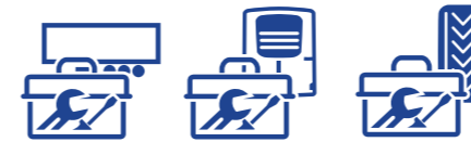
The Full Services for Trailer, Cooling Unit and Tyres can be freely combined with each other and with Protection.