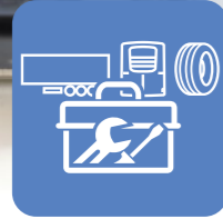
Full Service Maintenance & wear and tear