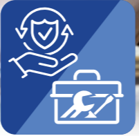
Full Service & Protection

Everything covered with one rate, one invoice, one contact person: Schmitz Cargobull offers a unique combination of full service and insurance cover. Full Service covers the costs of maintenance and wear and tear. "Protection" as insurance with all-risk coverage comprehensively covers severe damage as well as own and third-party faults.